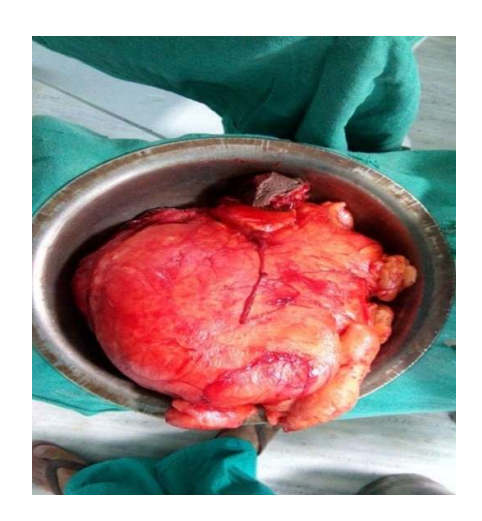
Fig. 5. Excised giant lipoma internal view