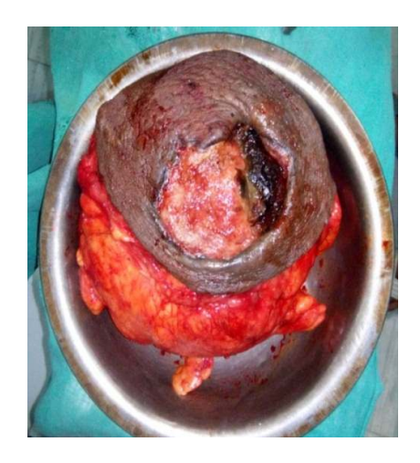
Fig. 4. Excised giant lipoma skin side view