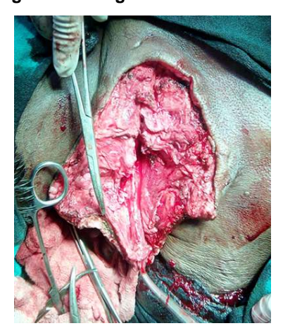
Fig. 3. Intra-operative finding after excision of swelling, showing no communication with spinal cord