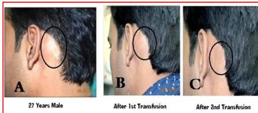
Fig. 3. (A) Vitiligo mark behind the left Ear. (B) Recovery after First UCB transfusion. (C) Complete recovery after 2 nd UCB transfusion

* 2/3 rd re-pigmentation in affected area, # half re-pigmentation in affected area