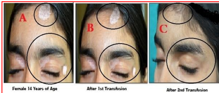
Fig. 4. (A) Multiple Vitiligo mark over face. (B) Recovery after First transfusion of UCB. (C) Almost complete recovery after 2 nd UCB transfusion