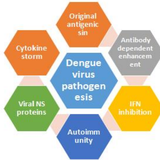
Fig. 2. Potential mechanisms of DHF and DSS pathogenesis

Antigen-detection is detectable through the incubation-period till the 12 th Day (convalescent) of the illness. IgG and IgM start rising from the 2 nd Day. IgM starts falling after the 10 th to 11 th Day – detectable window-period is found from 6 th Day to about 30 th Day. IgG becomes detectable from about 10 th to 11 th Day, and remains detectable, although peaking on about the 15 th Day only. In secondary-infection, IgG is markedly elevated and remains elevated. IgM is not as markedly elevated as in primary-infection [36].