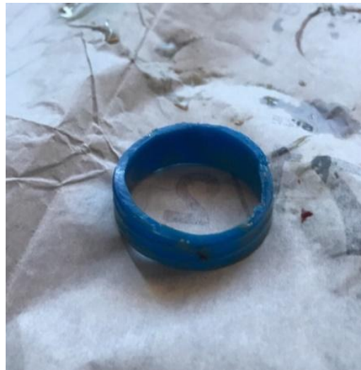
Fig. 1. Threaded neck of a plastic bottle

Foreign bodies may cause vaginitis leading to vaginal ulceration, ultimately involving the adjacent structures such as bladder and rectum, which causes urinary and fecal incontinence [3-5]. Foreign body in-situ may cause chronic inflammation and fibrosis, which leads to vaginal stenosis and complete obstruction eventually [6]. Ascending infections can give rise to endometritis, salpingitis and peritonitis. Rarely, unchanged pessaries may cause severe ulceration of the vaginal wall progressing to vaginal carcinoma with time [7]. Fortunately, none of the above complications occurred in the reported two cases.