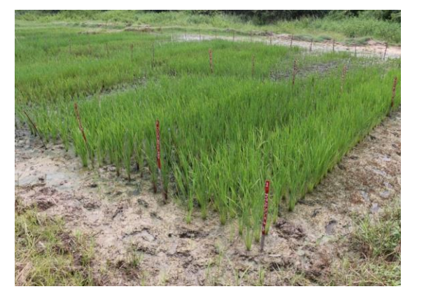
Plate 1. Over view of salinity block

If a character is driven by non-additive gene action, it may have high heritability but low genetic advance, but if it is governed by additive gene action, it will have high heritability (above 60%) and high genetic advance (above 20%), provides much potential for further improvement. As a result, the most significant strategy to make genetic gain through generations is to increase these qualities through selection. For the genotypes, the genotypic and phenotypic coefficients of variation, heritability, genetic advance, and genetic advance as a percentage of the mean were calculated and shown (Table 4; Figs. 1 &2).