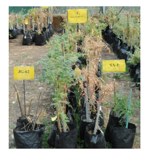
Fig. 7. F4 plants sown on in pots containing sick soil