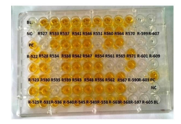
Fig. 8. Qualitative ELISA for F<sub>4</sub> plants

F4R-569, F4R-593, F4R-634, F4R-684 and F4R-684 were taller recorded above average height(61.28cm).The minimum number of secondary branches recorded were 3 while maximum numbers of branches recorded were 13 with average value of 6.59 in F<sub>4</sub> plants which is again significantly higher than SA-1 (4.29).The