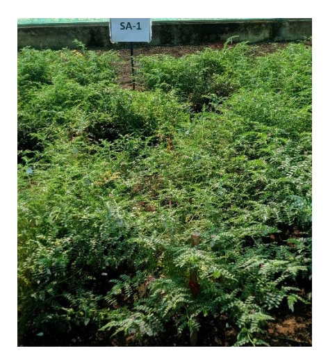
Fig. 6. SA-1plants

Kanthi et al.; J. Adv. Biol. Biotechnol., vol. 27, no. 8, pp. 802-812, 2024; Article no. JABB. 119669