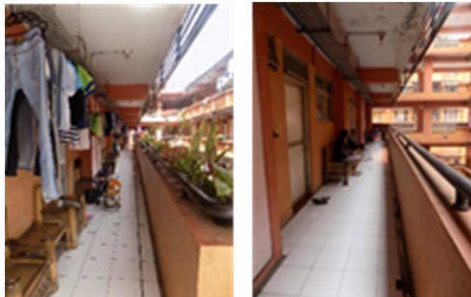
Figure 9. Informal activity in the corridor of Cibereum Rental Social Housing

Moreover, simple living habits from the tradition living is low-income communities also affect how to meet the needs of living in a small residential unit that is by invading the hallway which is the nearest space from residence to meet the needs of their life. The nearest unit's resident from the laundry room dominates the use of it (Fig. 10). Other residents can also use it with permission from the closest dwelling unit which is an agreement among residents.