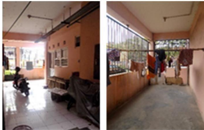
Figure 10. Domination particular resident on the laundry room based on distance to the unit

People rarely use the park, inner court, and social space. All those areas are less suited to the use of space inhabitants as the living traditions and physical elements are not able to accommodate the activities that occur. The park that the most suitable space for morning sports activities is inadequately resulting in the transfer of functions to other areas. The inner court consists of vegetation space that makes it space that accommodates simple social activities is less right according to the pattern of space use because it explain less close to the dwelling (Fig. 11). Simple social events tend to very close to occupancy mainly due to the togetherness of tradition of living.