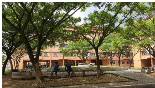
Figure 7. Park which is rarely used, children often play ball on the road at the park's perimeter

Simple social events such as sitting and relaxing tend to be rarely done at this distance. Unplanned activity at this range is a joint morning exercise caused by the difficulty of finding a place as large as a parking area on the market to do this action. Also, on the road, on the perimeter of the park, children often play ball, while the park itself is rarely used (Fig. 7).