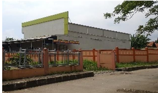
Figure 6. Indoor sport court as a space to play futsal

Simple social events such as sitting and relaxing tend to be rarely done at this distance. Unplanned activity at this range is a joint morning exercise caused by the difficulty of finding a place as large as a parking area on the market to do this action. Also, on the road, on the perimeter of the park, children often play ball, while the park itself is rarely used (Fig. 7).