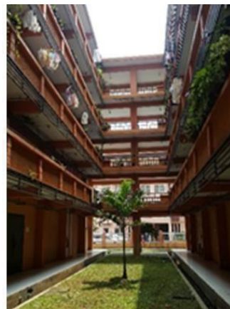
Figure 11. Vegetation on the inner court space

People rarely use the park, inner court, and social space. All those areas are less suited to the use of space inhabitants as the living traditions and physical elements are not able to accommodate the activities that occur. The park that the most suitable space for morning sports activities is inadequately resulting in the transfer of functions to other areas. The inner court consists of vegetation space that makes it space that accommodates simple social activities is less right according to the pattern of space use because it explain less close to the dwelling (Fig. 11). Simple social events tend to very close to occupancy mainly due to the togetherness of tradition of living.