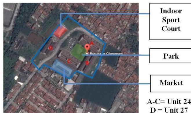
Figure 4. On-site environmental facilities of Cibereum Rental Social Housing (Google Earth, March 2017)