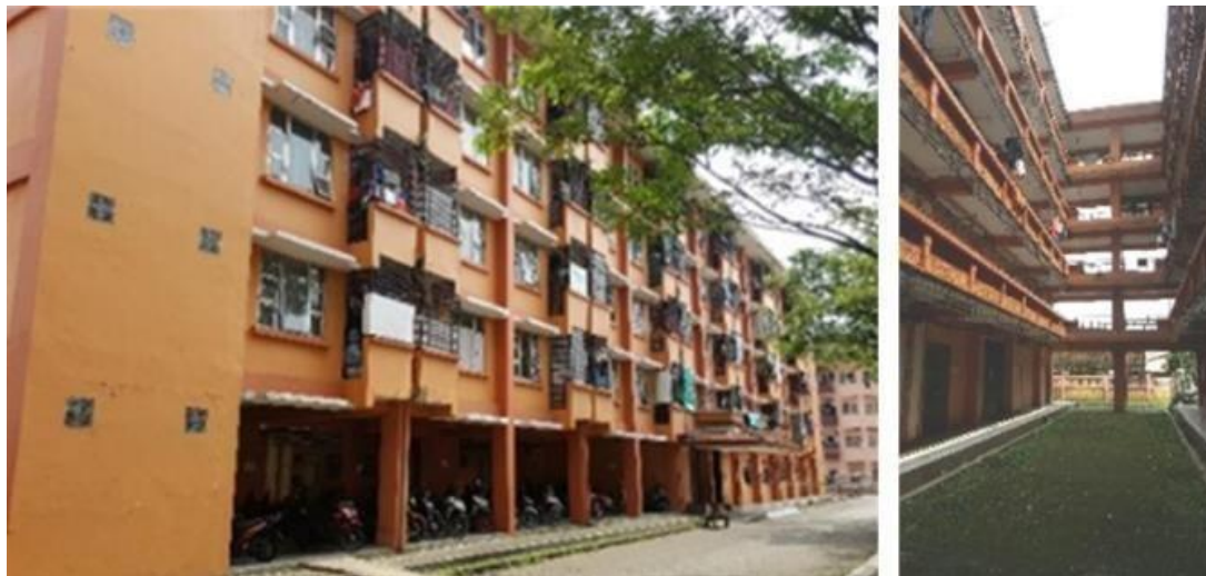
Figure 1. One bedroom building typology of Cibeureum Rental Social Housing (unit 24) using the inner court

Cibeureum Rental Social Housing is a complex of flats which consists of two types of building typology with environmental facilities and a supporting shared space in Cimahi City, West Java, Indonesia. This rental social housing role as a move for Cimahi residents living in urban squatter areas. Cibeureum Rental Social Housing capacity of 371 units, consisting of 297 units with one bedroom and 74 units with two bedrooms. What distinguishes both building topologies is the number of bedrooms, the use of inner court or atrium, and the layout. Typology of a one-bedroom building using the inner court (Fig. 1, Fig. 3), while in units with two bedrooms using atrium (Fig. 2, Fig. 3). Both also have different spatial arrangements.