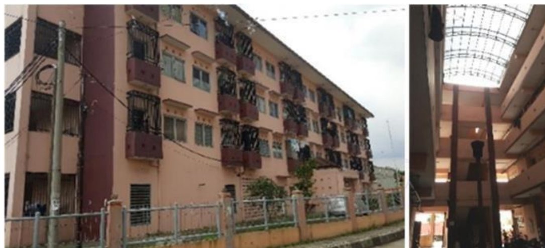
Figure 2. Two bedroom building typology of Cibeureum Rental Social Housing (unit 27) using the atrium