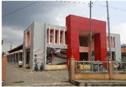
Figure 5. Market as a space to do transactions mainly about life necessity