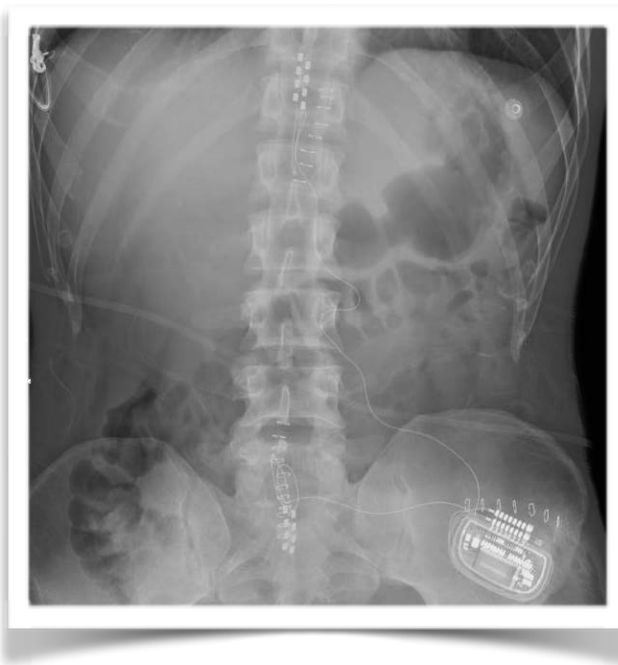
Picture 3. Permanent thoracic SCS and SNS.