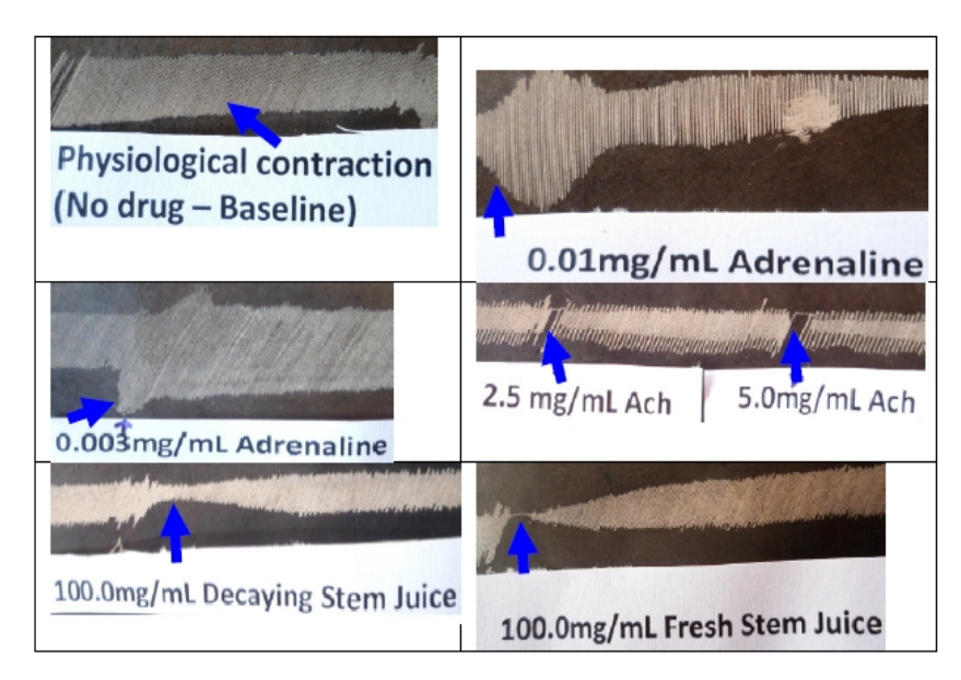
Fig. 3. Kymograms of adrenaline, acetylcholine and different doses of fresh and decayed stem juices of Musa acuminata X balbisiana on contractility of the isolated rabbit heart