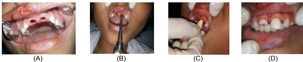
Fig. 1. Intraoral photograph showing immediate after reported to dentist (A), removal of clot and debris from the alveolar socket (B), immediate placing the tooth to corresponding socket (C), to evaluate the occlusal relationship (D)

Study found that mature teeth in children and adolescents exhibit more extensive inflammatory root resorption after replantation compared to adult [13]. The mentioned increase root resorption rate is related to the bone remodelling which is more extensive in children during the grow-up period. The root resorption ankylosis may give rise to infraocclusion during the growing process [13]. Either prosthetic replacement of the missing incisors, or prosthetic implant placement might be alternative treatment options for our presented case, if replantation were not practicable. However, both of the options need time for complete root formation of the abutments as well as adequate bony thickness of implant. In this aspect, the period of sustainability of replanted teeth bears utmost importance.