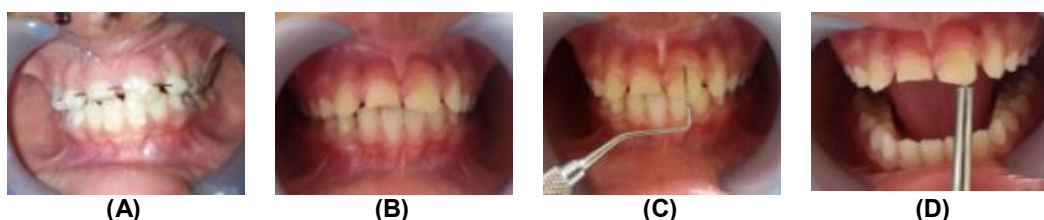
Fig. 4. Post treatment intraoral photograph on the 10 days recall visit after management (A), immediate after removal of bonded wire (B), checking of periodontal pocket at 6 months recall visit (C), checking of functional at one year recall visit (D)

The knocked out teeth can maintained aesthetic and functional properties for some years after the replantation. In this report, the replanted teeth remained in a stable functional position during 12 months follow-up period without any sign of ankylosis or resorption. Despite the positive results observed after 1 year, clinical and radiographic follow-up of the teeth also planned for further follow up. As such injuries are not uncommon, in the developing country like Bangladesh where advance materials and infrastructure is not available, following such management protocol with basic technique could save million.