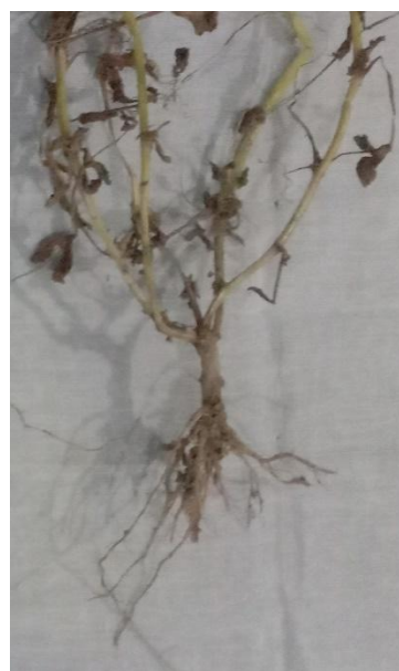
Fig. 7. Pri. roots 15.4 in number