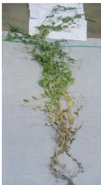
Fig. 6. Full length with roots