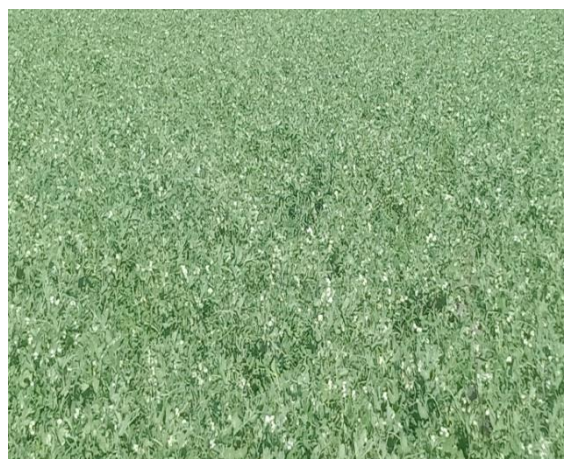
Fig. 3. Plant height 1.85 meters on 89 DAS