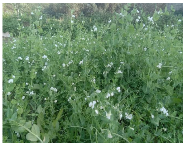
Fig. 2. 8 February 2023 , 80 th Day after sowing