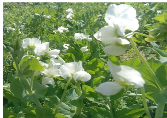
Fig. 1. 12 January, 2023 , 53 rd Day after sowing