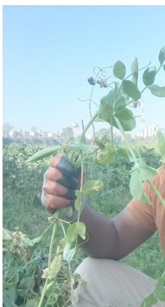
Fig. 5. Harvesting time 4 March