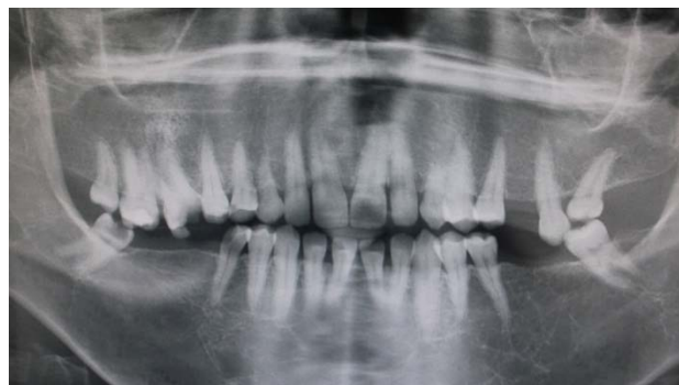
Figure 3. Panoramic view of the enlargement of marrow spaces with widened trabeculae.

Tooth transposition can be complete and incomplete based on the position of the roots and the crowns of transposed teeth. While the complete