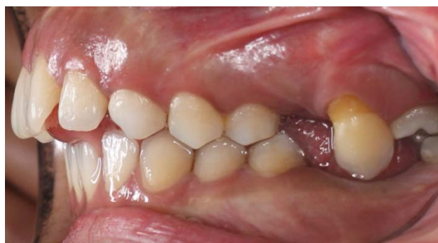
Figure 1. Intraoral view of the canine erupting mesial to the third molar.