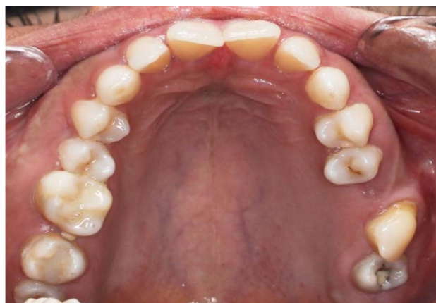
Figure 2. Occlusal view of the transposed maxillary canine.

Tooth transposition is a form of ectopic eruption, which can affect the maxillary or mandibular arch. This dental anomaly frequently involves the canine and first upper premolar. 1,5-6 The unilateral dental transpositions are more prevalent than the bilateral ones and mostly affect the left side. 1,5 No transposition has been reported in the deciduous dentition yet. 5,13