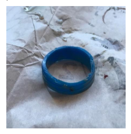
Fig. 1. Threaded neck of a plastic bottle

Foreign bodies may cause vaginitis leading to vaginal ulceration, ultimately involving the adjacent structures such as bladder and rectum, which causes urinary and fecal incontinence [3-5]. Foreign body in-situ may cause chronic inflammation and fibrosis, which leads to vaginal stenosis and complete obstruction eventually [6]. Ascending infections can give rise to endometritis, salphingitis and peritonitis. Rarely, unchanged pessaries may cause severe ulceration of the vaginal wall progressing to vaginal carcinoma with time [7]. Fortunately, none of the above complications occurred in the reported two cases.