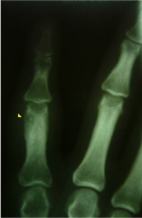
Figure 1. Anteroposterior radiograph of the right hand. The radiological examination showed a lytic lesion (arrow head) with irregular border with a central sclerotic nidus and also sclerotic changes around the lytic lesion and bone expansion in the proximal phalanx of the right index finger.