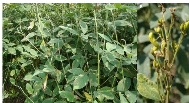
Figure 1. (A) Alternaria blight symptom on leaves and (B) aerial plant parts (leaves, stem, buds and pods).

The pathogen proved pathogenic on pigeonpea cultivar ICPL 87119 and identical disease symptoms as observed