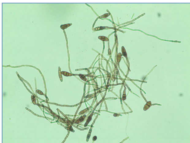
Figure 2. Conidial and mycelial morphology of Alternaria alternata .

in the field symptoms on leaves were small, circular, necrotic spots that developed quickly forming typical concentric rings. Later, these spots coalesced and caused blighting of leaves. Spots were initially light brown and later turned dark brown were observed 10 days after inoculation. No symptoms were observed on control plants.