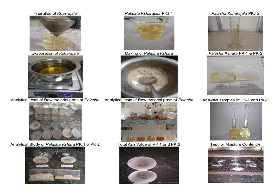
Fig. 2. Analytical processing of Palasha Kshara