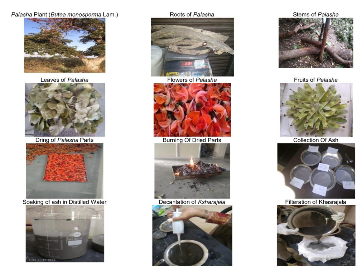
Fig. 1. Pharmaceutical processing of Palasha Kshara