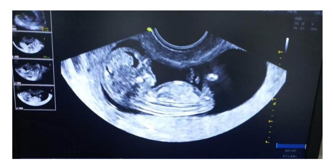
Fig. 1. A dating scan

Saravanan and Kirubamani; JPRI, 33(47B): 950-958, 2021; Article no.JPRI.75017