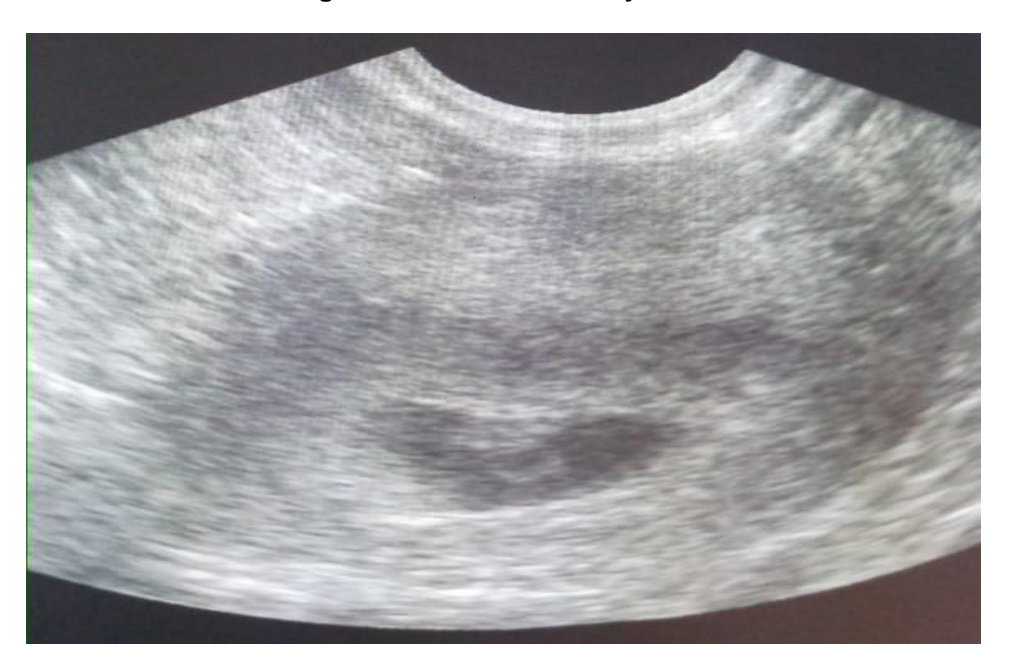
Fig. 4. Gestational SAC seen on a sonogram

Nuchal translucency tests were done only for 25% of the women. All the participants who underwent the test were found to have normal NT values (less than 2mm).