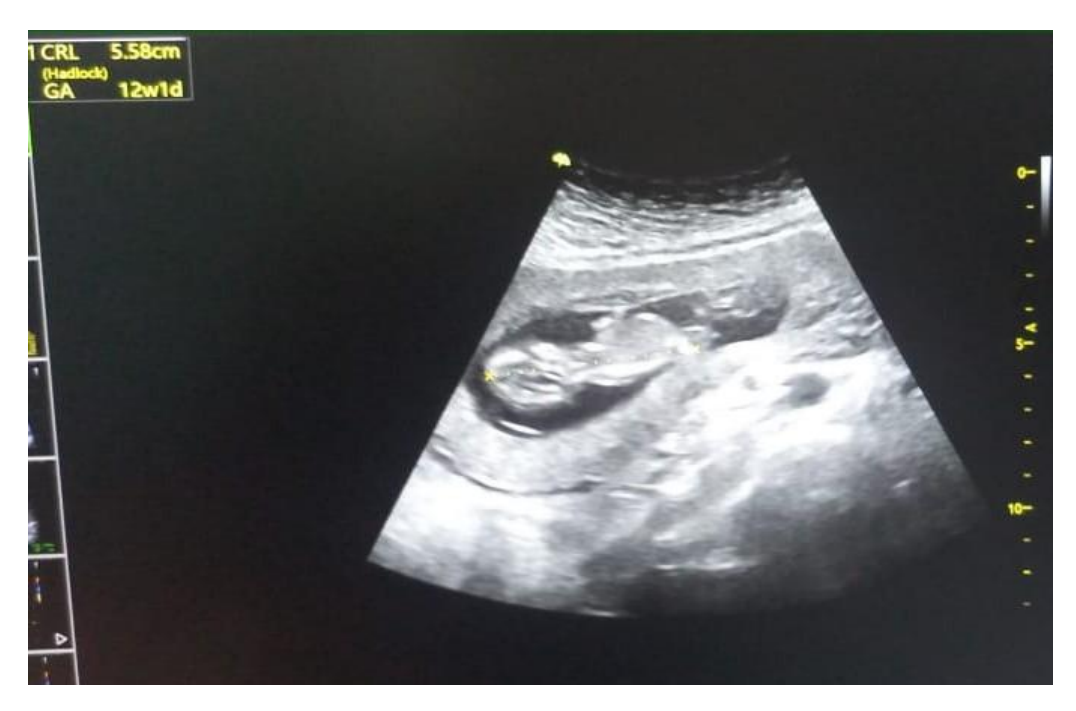
Fig. 2. A scan measuring the crown rump length