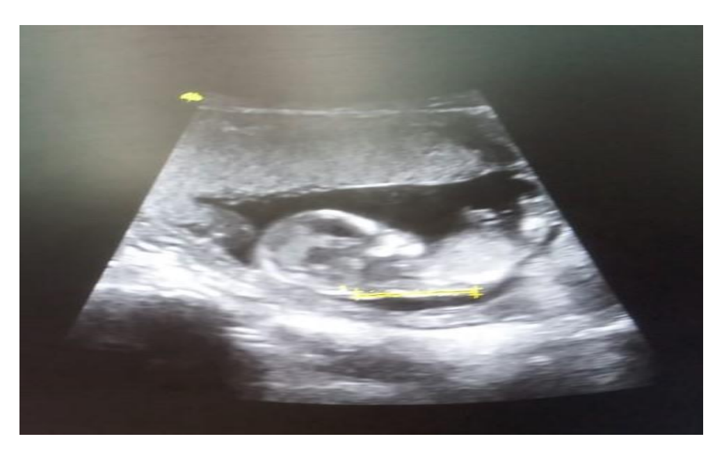
Fig. 3. Nuchal translucency scan

Saravanan and Kirubamani; JPRI, 33(47B): 950-958, 2021; Article no.JPRI.75017