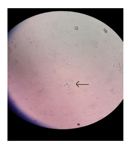
Fig. 1. Germ Tube Indicating Candida Albicans

Damola et al.; Int. J. Path. Res., vol. 13, no. 3, pp. 90-104, 2024; Article no.IJPR.116980