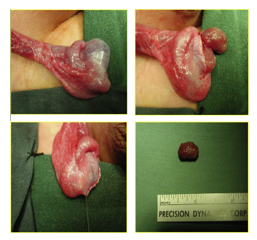
Figure 1 Intraoperative views from an 11-year-old boy with a right Leydig cell tumour.

The commonest type of prepubertal testicular tumour is the malignant yolk-sac tumour, followed by teratoma [2]. Furthermore, the 30-year data from one centre in Turkey showed that yolk-sac tumour is the most common type [3]. Analysis of data from four paediatric centres in the USA showed a much higher proportion of