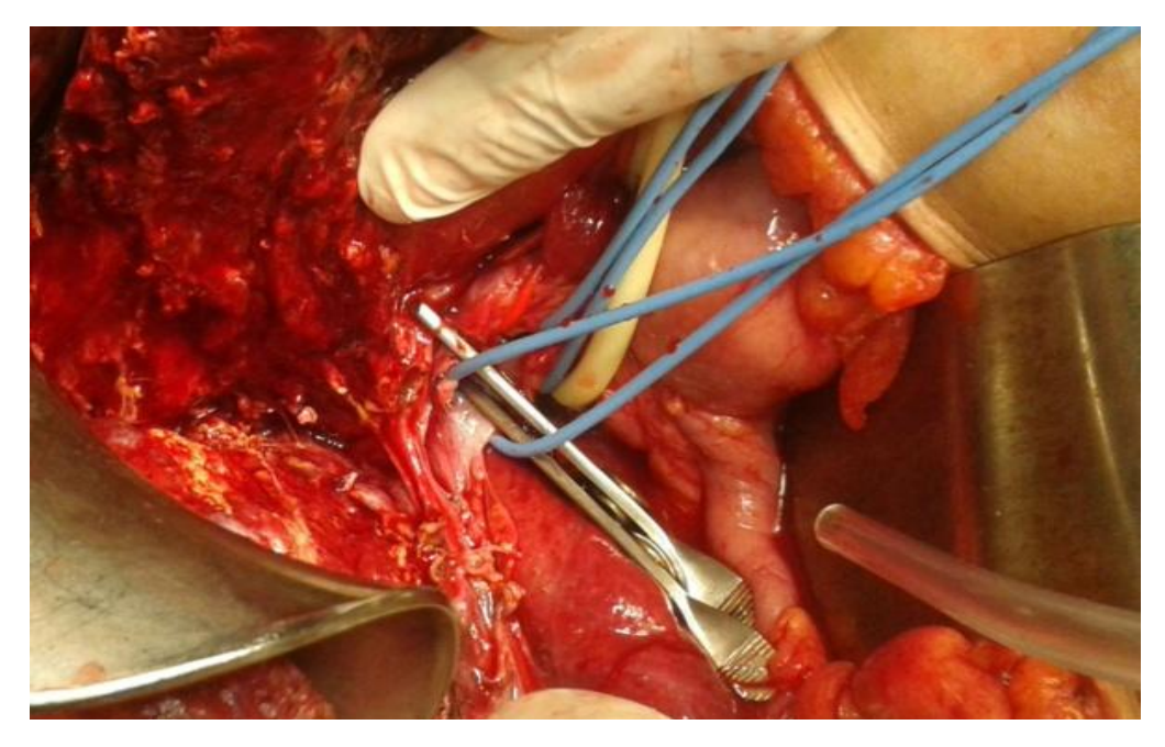
Fig. 2. Intraoperative view of clamped right portal vein and right hepatic artery