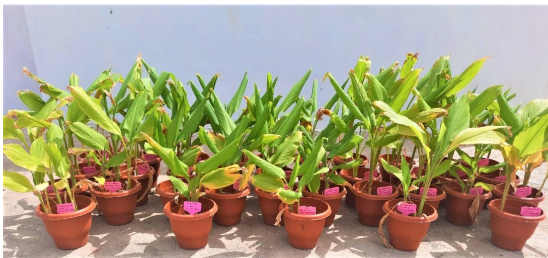
Fig. 1. Stage 3 (3 months after salinity treatment) of germplasms selected for phytochemical analysis

The total phenolic compounds in the turmeric plants that were salt treated, were estimated by using the standard protocol [15]. Here, the total phenolic compounds were estimated from the developing leaves and rhizomes of all the control and salt-treated plants. For this estimation, 0.5 gms of developing leaf and rhizome samples were taken and properly amalgamated with 10 ml of 80% ethanol using a mortar and pestle. To this amalgam the required reagents like Folin-Cio-Calteau's reagent was added to estimate total phenolic content and the samples were kept incubated in the 80% methanol overnight and estimated in case of curcumin content.